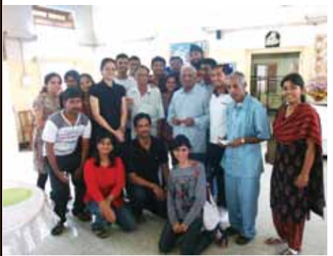
XSeed members at Little Sisters for the Poor

Members of XSeed, the social activity club of XIME, visited an old age home, 'Little Sisters of the Poor' in the early September.