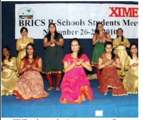
XIME students performing a contemporary Dance

The students of XIME showcased India's rich cultural diversity through a cultural extravaganza. Popular songs and dances such as Punjabi and Rajasthani folk enthralled the foreign guests.